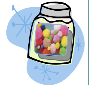
Example of a class Pom-Pom Jar

Additionally, we reinforce positive behaviors by encouraging children to recognize themselves and each other for following class rules. Pom-poms are added to the class jar for positive behaviors, and when the jar is full, we have a good behavior celebration!